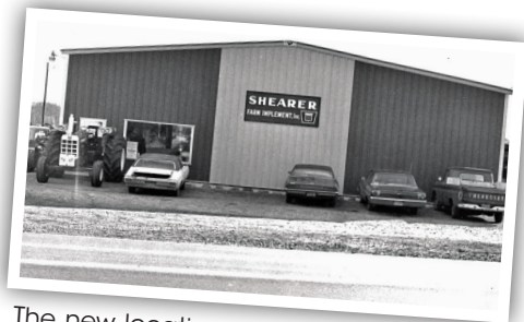
The new location was at 1344 W. Lincoln Way. Both locations can be seen from the fairgrounds.