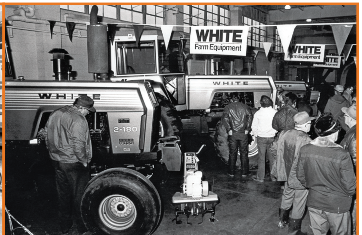
A picture of our open house.