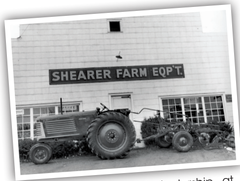
This was the original dealership at 1119 W. Lincoln Way. It is now a Chevy dealership.

In 1971, my dad purchased the local Oliver dealership. The dealership originally opened its doors in 1937. Every chance I had, I was at the dealership. Whether it was a late night going back in with dad to sweep the floors, fill the literature racks or help file paperwork or getting up early on a Saturday mornings and being there from 7:00 to 3:00, I enjoyed the dealership and being with the customers. I also have to admit that the penny peanut machine was quite a draw for me too! One of my