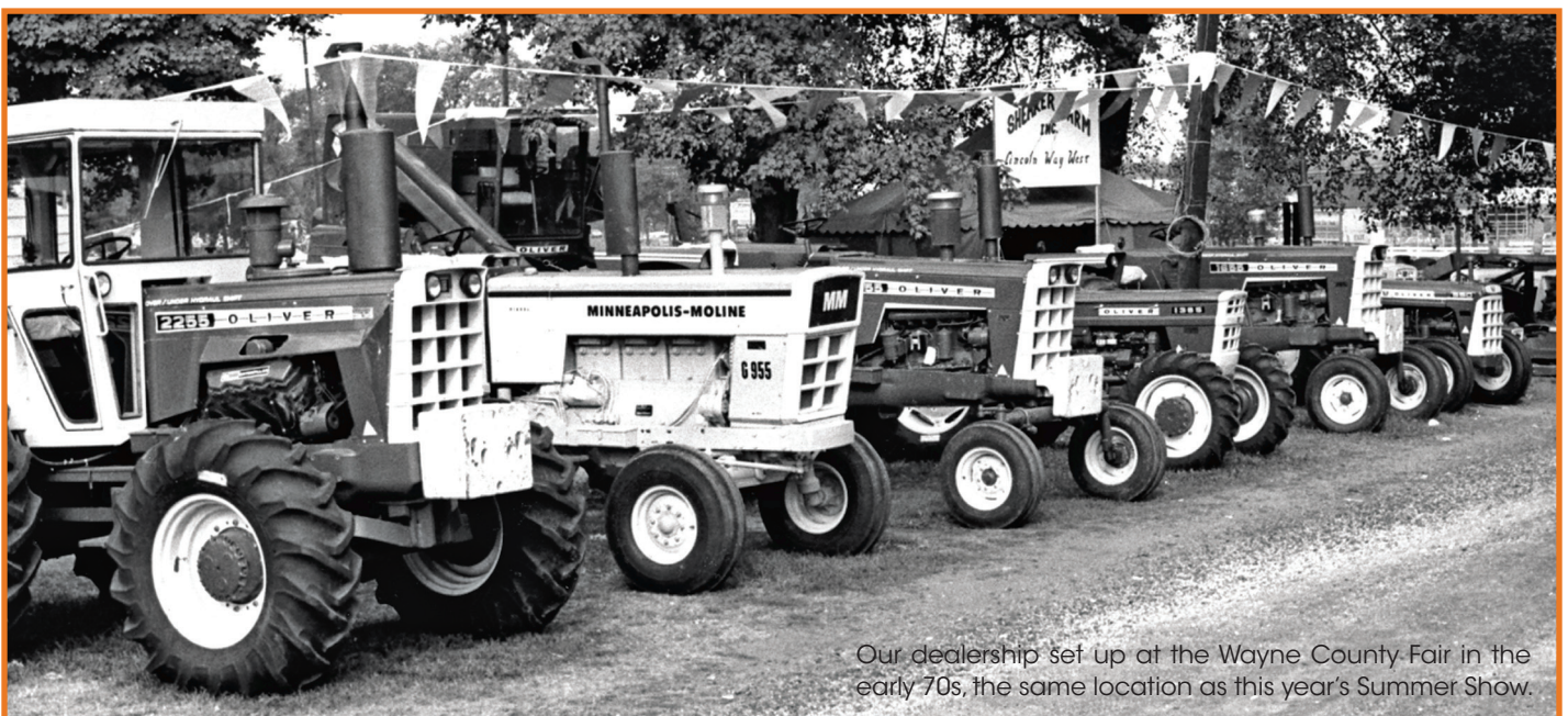
Our dealership set up at the Wayne County Fair in the early 70s, the same location as this year's Summer Show.

I know for some, the past couple months has been a bit of a challenge in trying to get a hold of me. Along with being heavily involved in putting together the 2011 Summer Show, I have recently sold my house and purchased a new place that has a 24'x24' shop on the property. By the time this article comes out, I hope to be moved in, have most of my parts unpacked and ready to roll. 🇳🇵