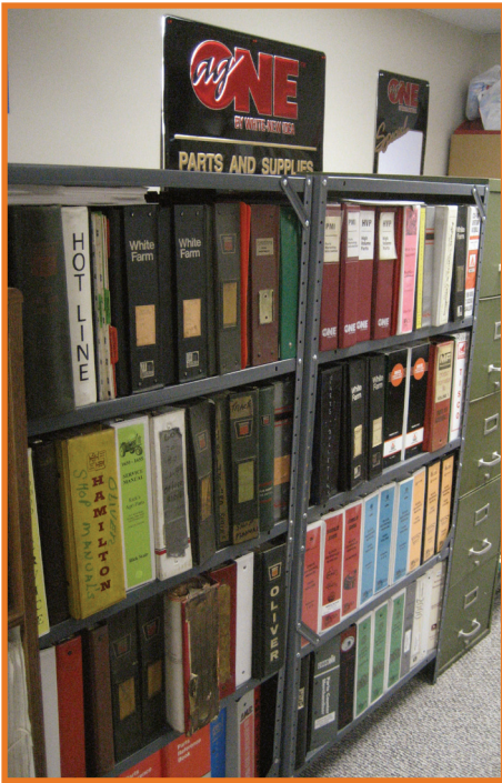
Some of Rick's parts books.